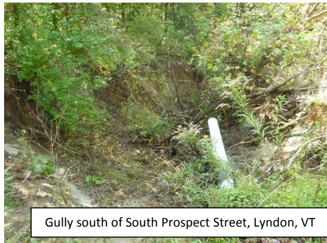
Gully south of South Prospect Street, Lyndon, VT

Evan Fitzgerald attended a steering committee meeting with representatives from the Village of Lyndonville, the Town of Lyndon, VTDEC, and CCNRCD to discuss specific stormwater concerns within the project area on September 28 th , 2016. The Village and Town road foremen identified several areas of problematic runoff and erosion, and these areas noted on a large map during the meeting. Kerry O’Brien, Ben Copans, and Evan Fitzgerald made some field visits to follow up on a few sites east of the Village area after the meeting. The stormwater