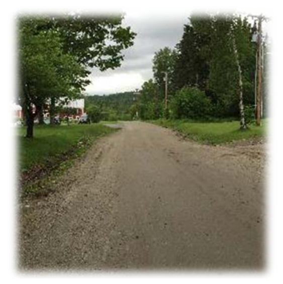
Road erosion assessment site DMB1 near Burke Mountain Academy on Alpine Lane.

We conducted our assessment and prioritization over three days of field work throughout the spring and early summer of 2015. To guide our assessment we used both our own observations of sections of unpaved roads that had the potential for road erosion impacting water quality as well as the Vermont Agency of Natural Resource's Road Erosion Risk Analysis (RERA) layer, developed for the ANR in the fall of 2014. This assessment, available through the VT ANR's Natural Resources Atlas, displays the results of a GIS model that analyzes road slope, soil erodiblity, and proximity to mapped waters of the State (streams, wetlands, ponds, etc.). These factors contribute to a constraint value and are then classified as either Low, Moderate, or High risk. We extracted the RERA segments for Dishmill Brook's watershed and conducted in-field assessments of each of them.