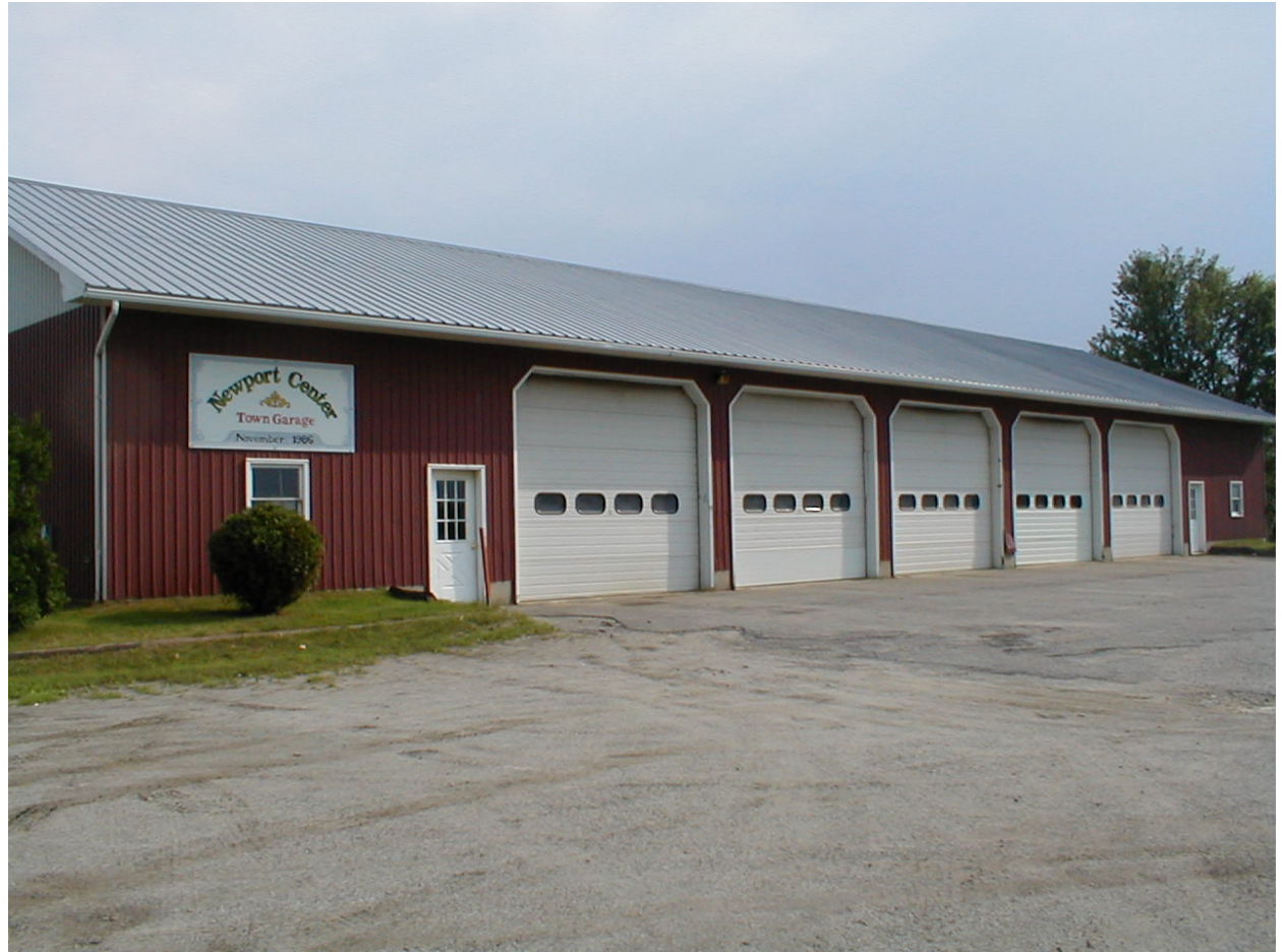
Newport Town Garage

Selectboard Newport Town P.O. Box 85 Newport Center Vermont 05857 (802) 334-6442